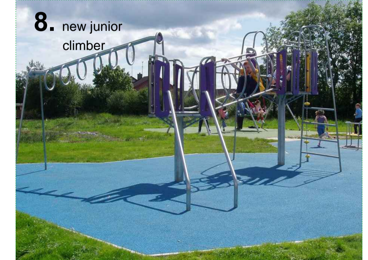
8. new junior climber