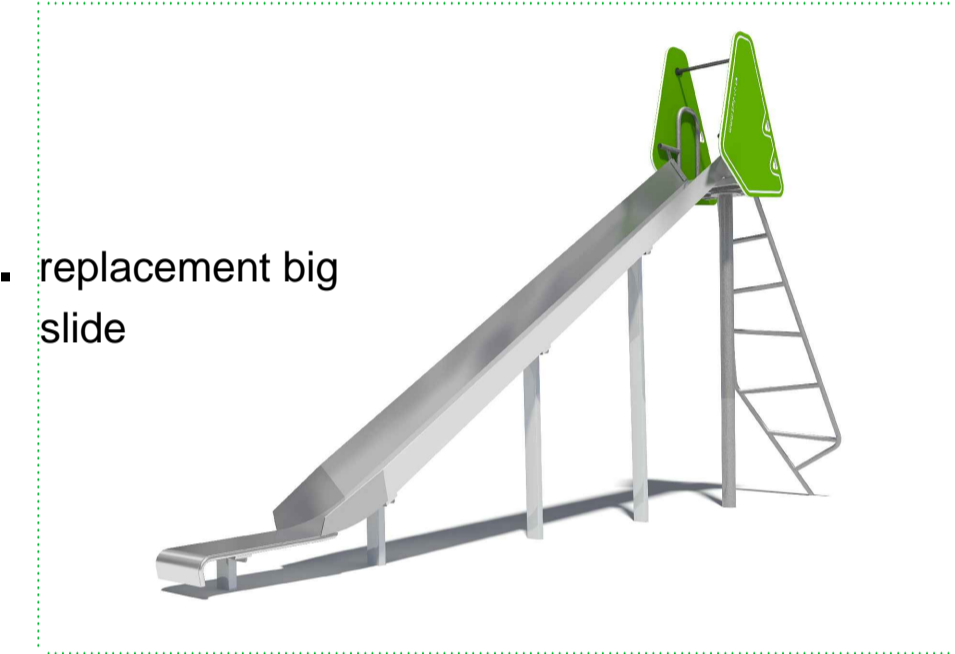
7. replacement big slide

ALL AGES OUTDOOR TRAINING GYM. IN THIS AREA