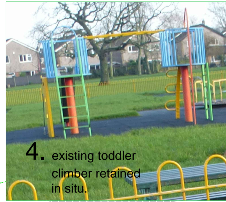
4. existing toddler climber retained in situ.