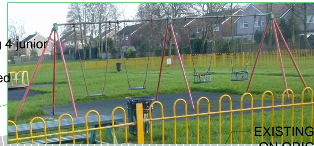
EXISTING RAILING RETAINED ON ORIGINAL LOCATION