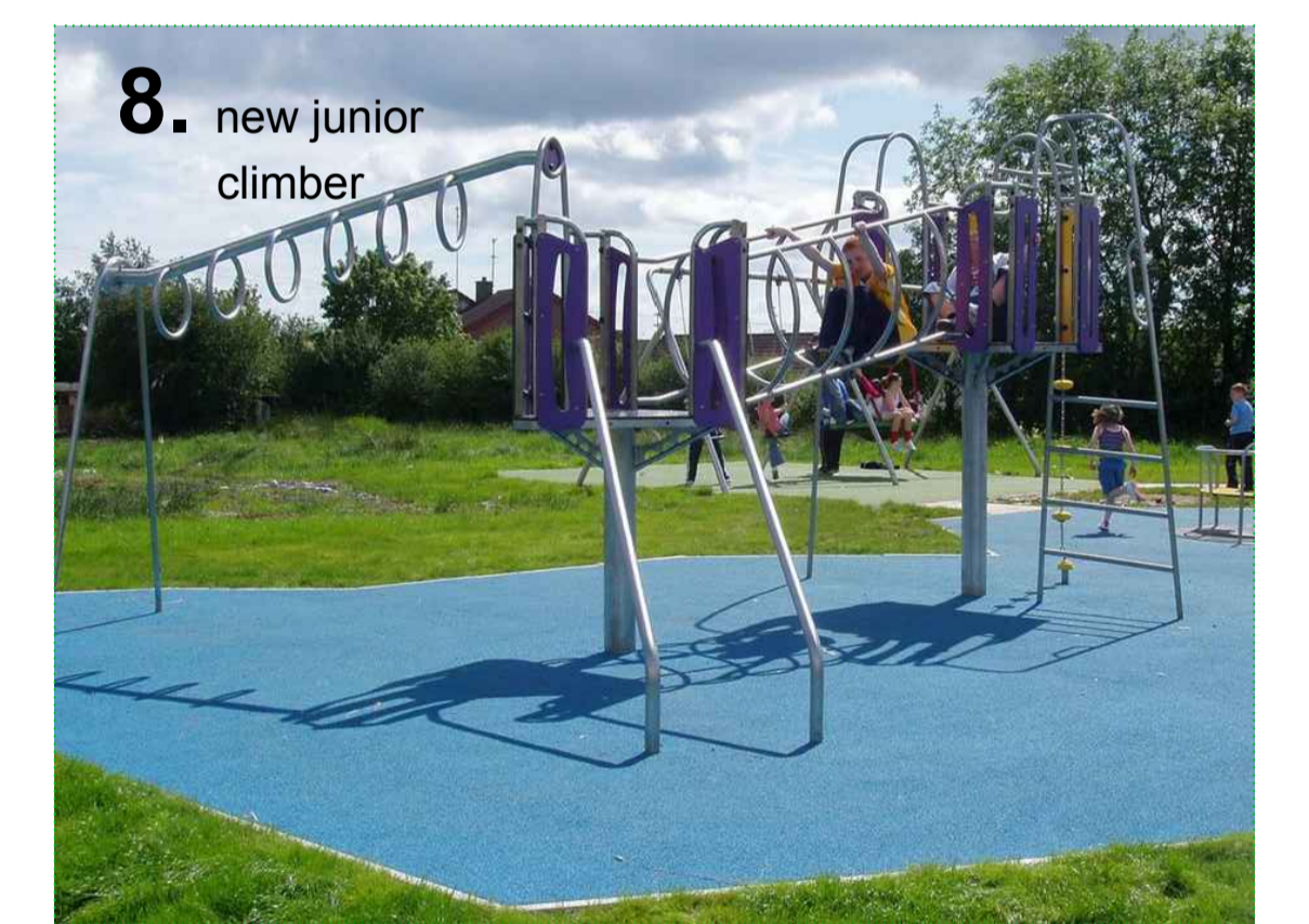
8. new junior climber

Option 2 for Play Area: Remove all old equipment. Provide all new equipment. Provide new paths and safer surfacing. Set within existing railings.