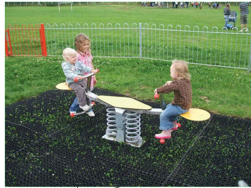
1. new twin springer