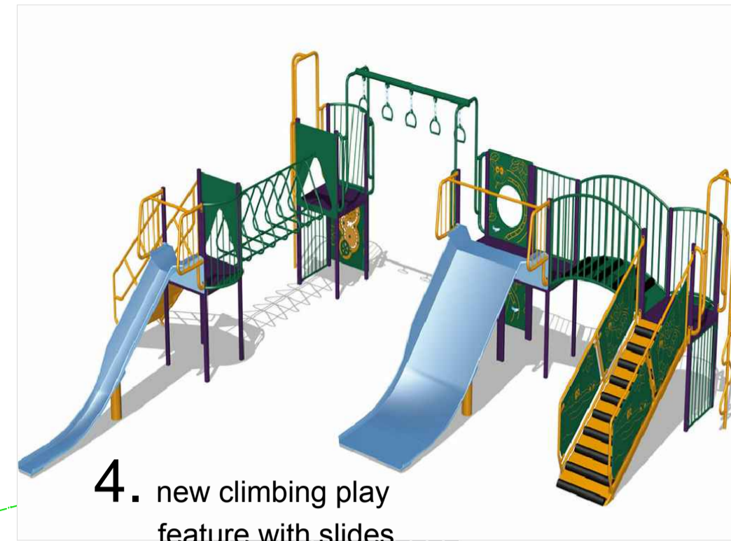
4. new climbing play feature with slides, climbers and monkey bars