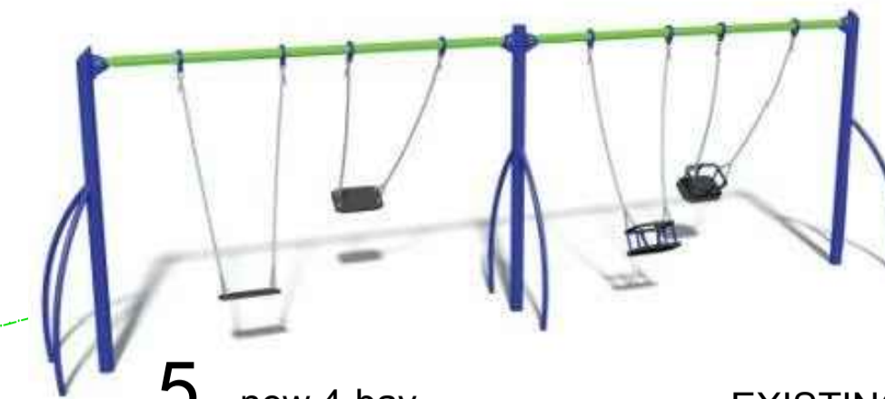
5. new 4-bay swings by Wickstead.