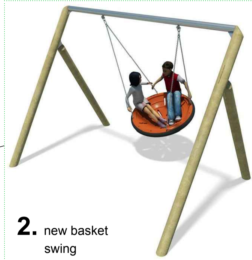
2. new basket swing